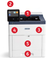
Xerox® VersaLink® C500 Color Printer Print.