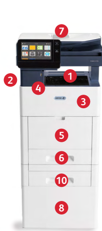
Xerox® VersaLink® C505 Color Multifunction Printer Print. Copy. Scan. Fax. Email.